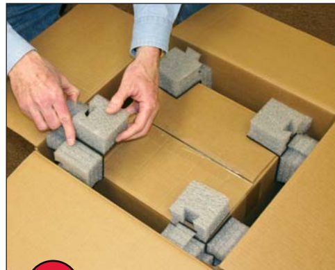
2 Place top corners