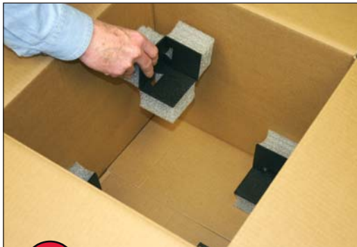
1 Place bottom corners