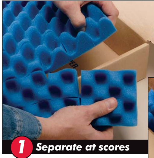
1 Separate at scores