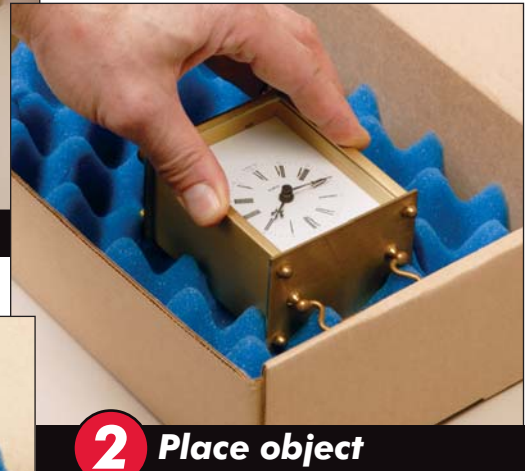
2 Place object