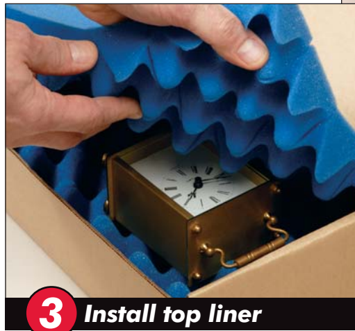
3 Install top liner